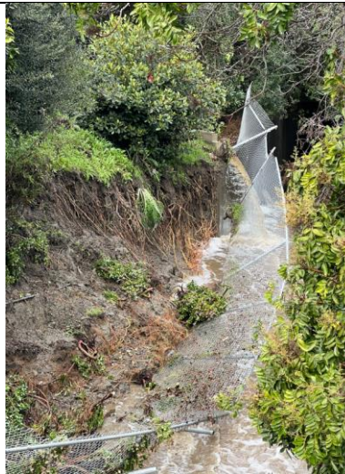
Channel After Wall Failure