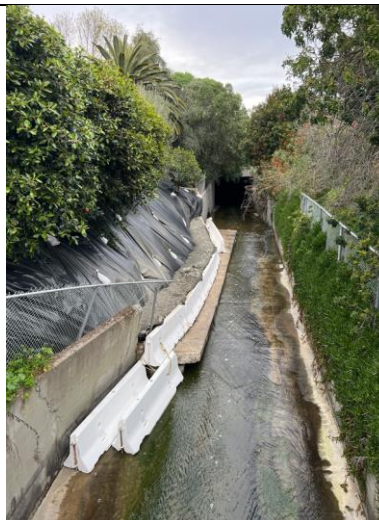
Channel After Temporary Slope Repair

A summary of the total construction expenditures is provided below: