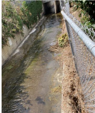
Channel Before Wall Failure