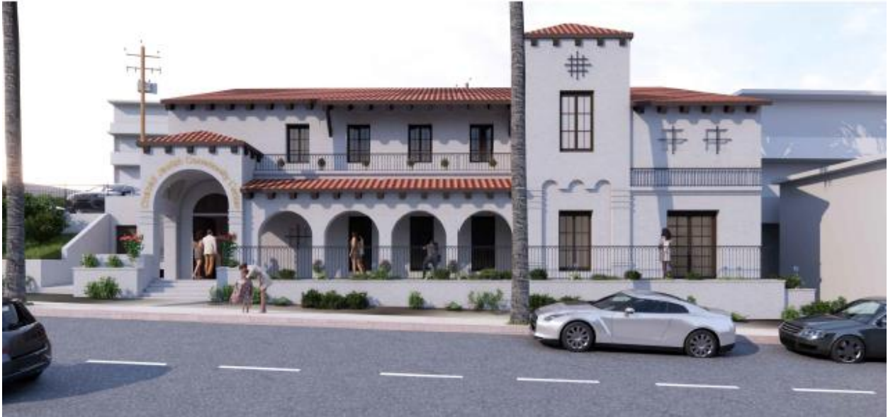
Figure 1: Rendering Perspective from N. El Camino Real