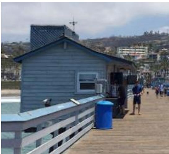
Exhibit 1. Proposed mural locations

See Exhibit 1 for an image of existing site conditions.