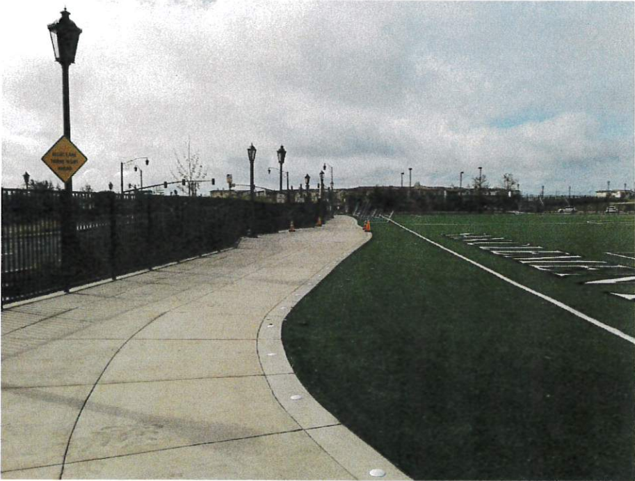
Photo 2. Looking west, area between long edge of soccer field and park perimeter fence.