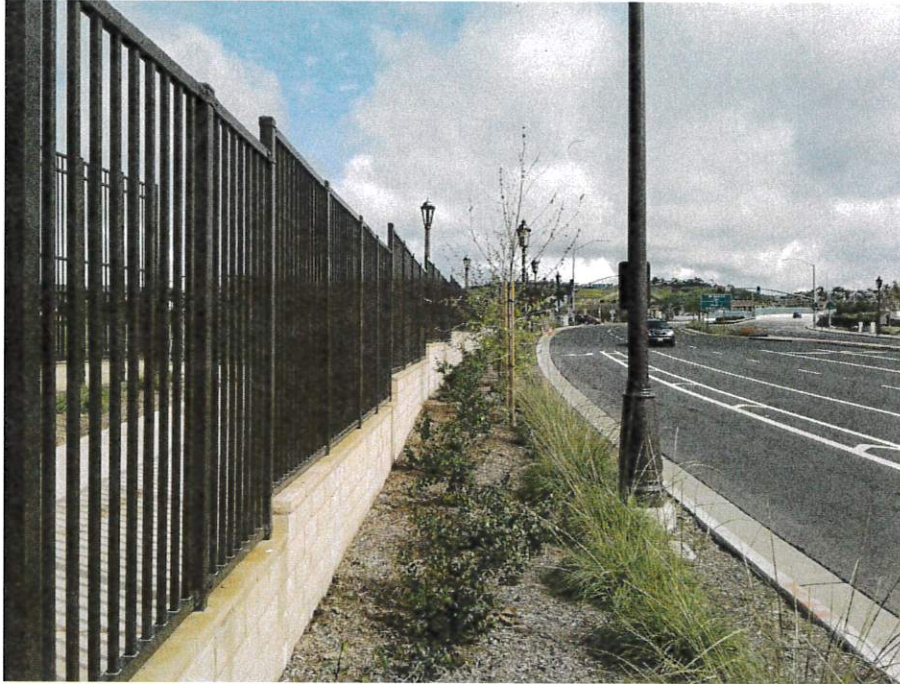
Photo 3. Looking east, area between park perimeter fence and Ave. Vista Hermosa.