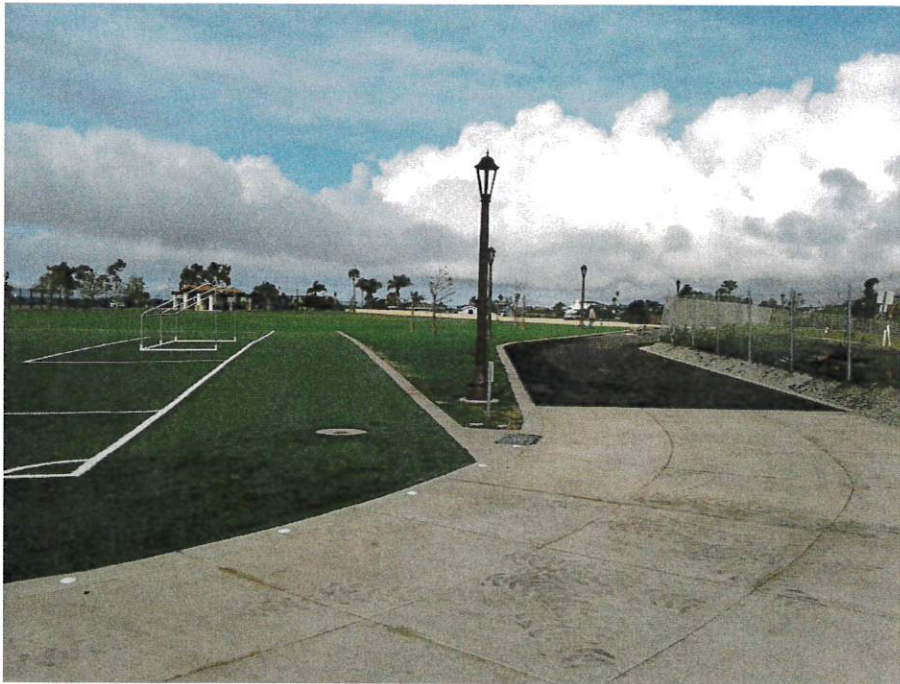
Photo 4. Looking north, area between goal line of soccer field and park perimeter/freeway fence.