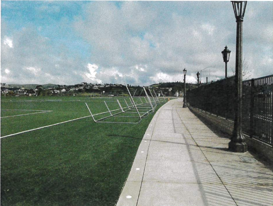
Photo 1. Looking east, area between long edge of soccer field and park perimeter fence.