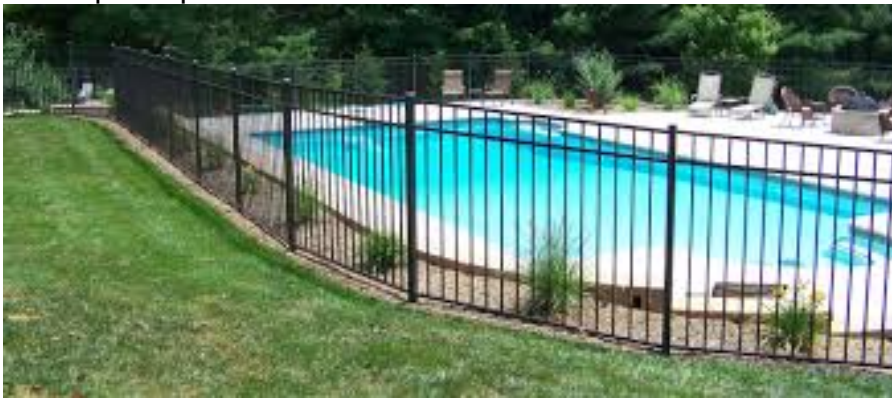
Below is a non-compliant barrier fence. The horizontal members must be 45 inches apart to prevent a climbable condition.