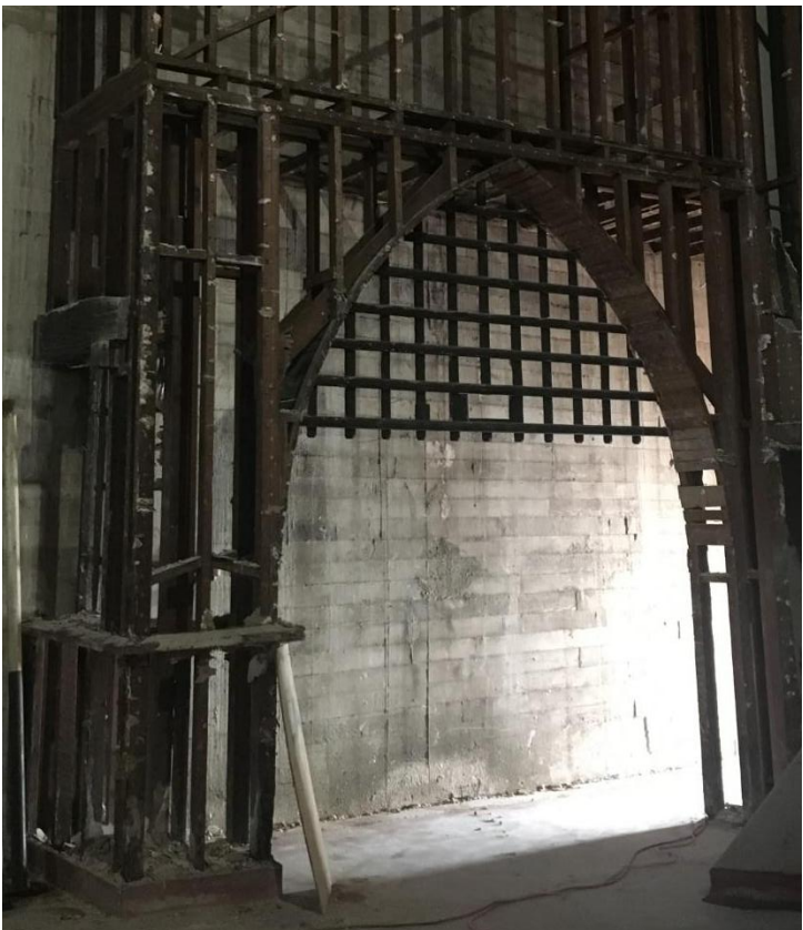
Honed wood mock gate in theater space