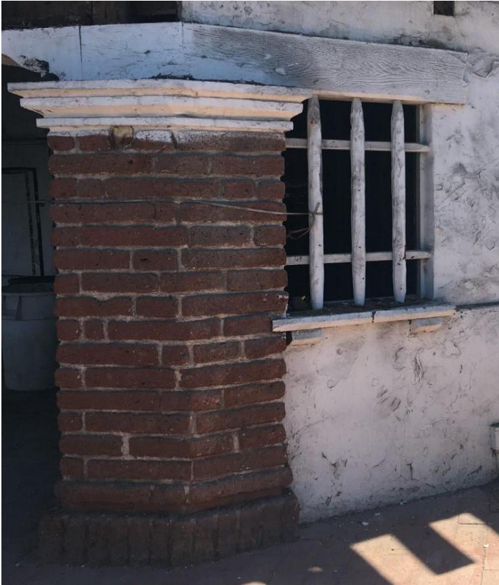
Honed wood bars at ticket window