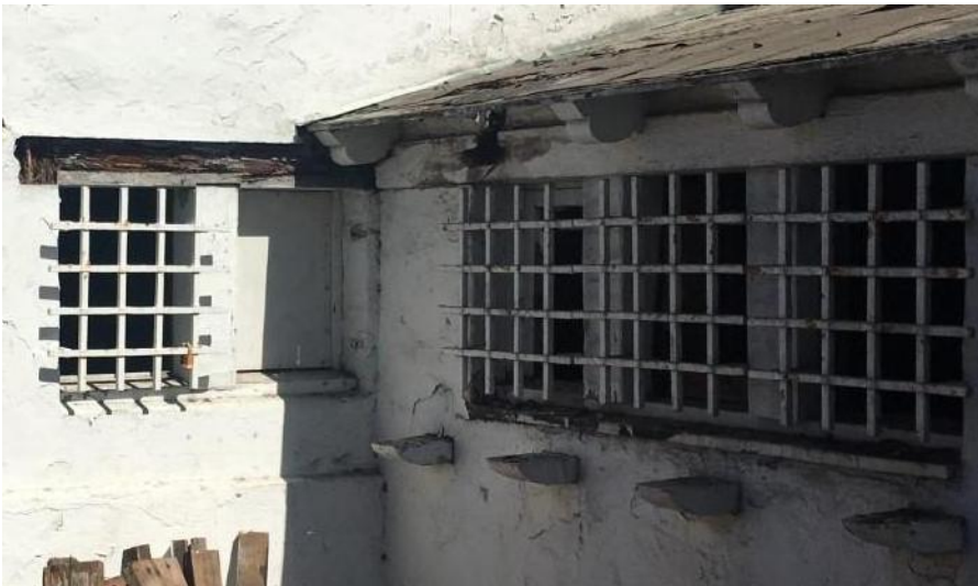
Metal bars over windows