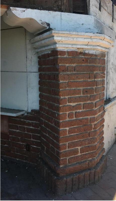
Column capital and brick columns at portico