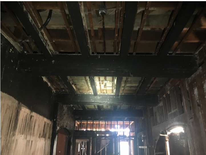
Drop beams in ceiling of lobby space