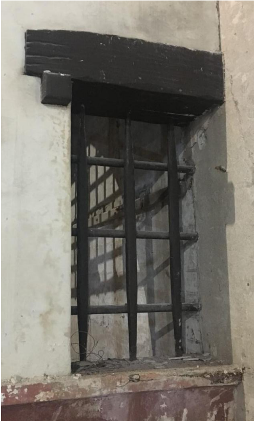
Honed wood bars in theater space