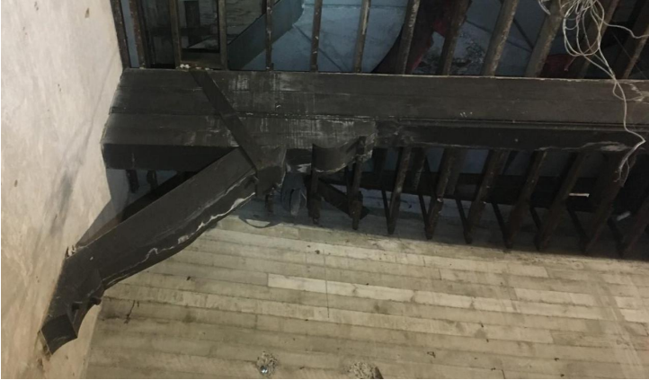
Large beams with diagonal bracing in theater space