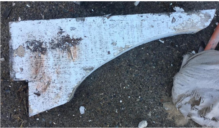
Corbels and architectural detailing for the Spanish Colonial Revival vernacular of the exterior of the building need to be salvaged for reuse or documented for recreation.