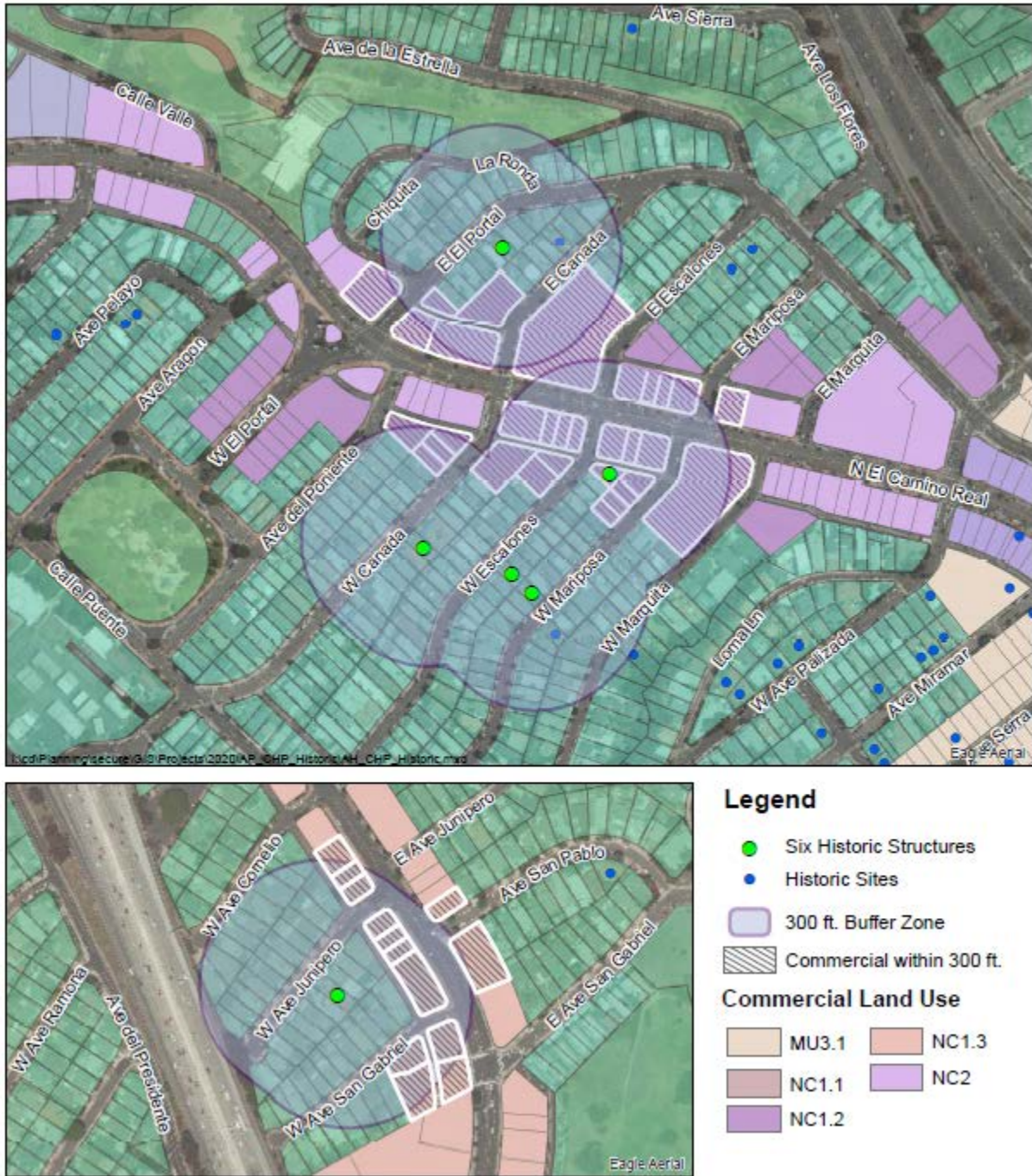
Figure 1. 300 Foot Buffer from Historic Structures

This amendment would modify Table 17.16.100(B) to require a Cultural Heritage Permit, instead of an Architectural Permit, for projects on nonresidential and mixed-use sites within 300 feet of residentially zoned buildings on the City’s Designated Historic Resources and Landmarks list and affect the properties within 300 feet of the six properties bulleted above.