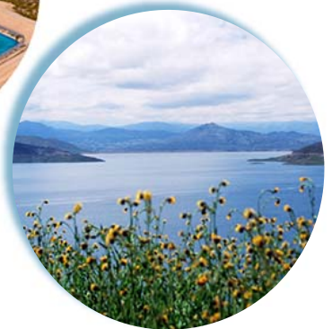
Diamond Valley Lake