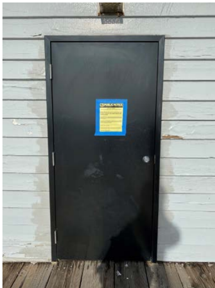
Exhibit 1. Proposed mural location (plumbing chase door)

See Exhibit 1 for an image of existing site conditions.