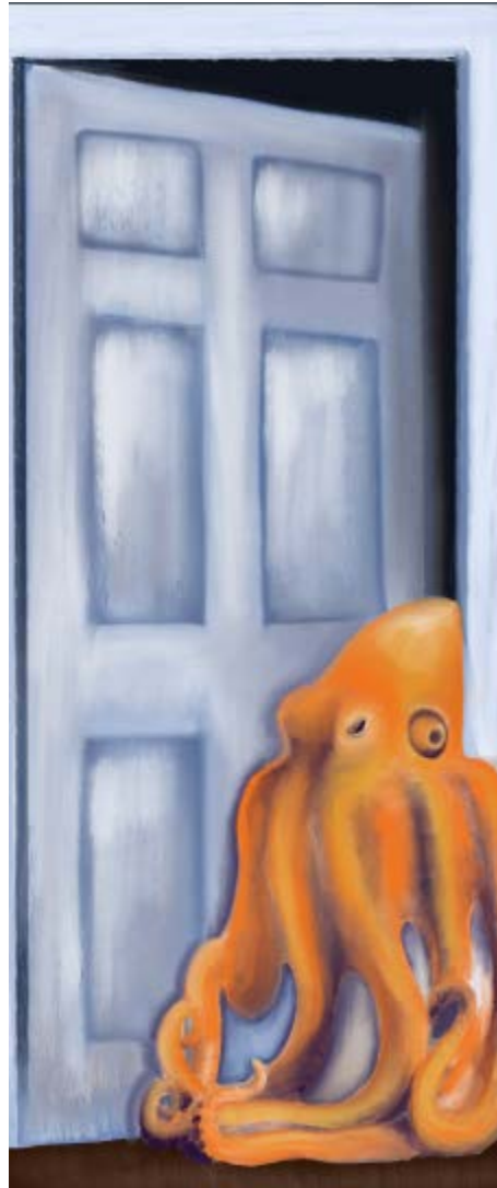
Exhibit 2. Proposed Sketch of Mural – “Open Door Policy”