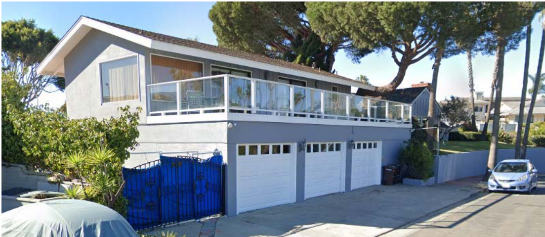
Figure 1 – Existing Site Conditions