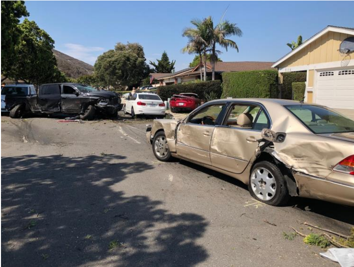
August traffic collision on Camino de Los Mares. Driver struck curb and median, hit four parked vehicles and injured two bicyclists and one pedestrian.