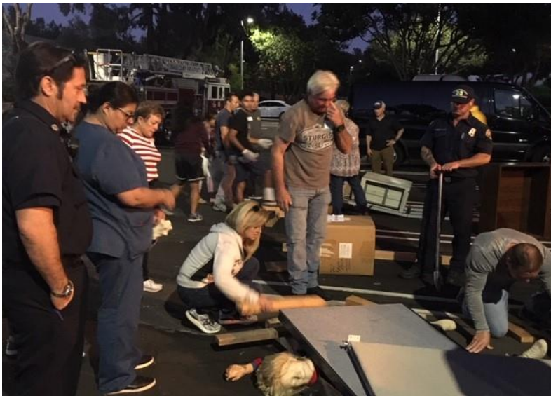
September 19 th T59 assists with CERT: Light Search and Rescue