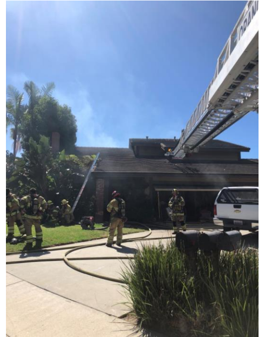
September 17 th Structure Fire on Calle Juarez. Two story house, 3 deceased dogs found inside.