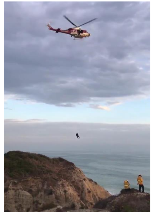
OCFA helicopter rescues uninjured hiker who had fallen down a cliff at San Clemente State Beach