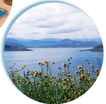
Diamond Valley Lake