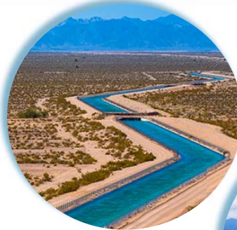
Colorado River Aqueduct