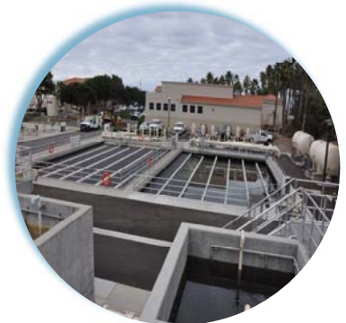
Water Reclamation Plant

The City's water reclamation plant treats wastewater while also producing recycled water for irrigation. It delivers approximately 1,400 acre feet of recycled water per year for irrigation to 52 sites in the City that might otherwise rely on potable water. These customers are primarily homeowner associations and business parks, city parks, schools and traffic medians. Recycled water provides a new source of supply and reduces the City's reliability on imported water from the Metropolitan Water District.