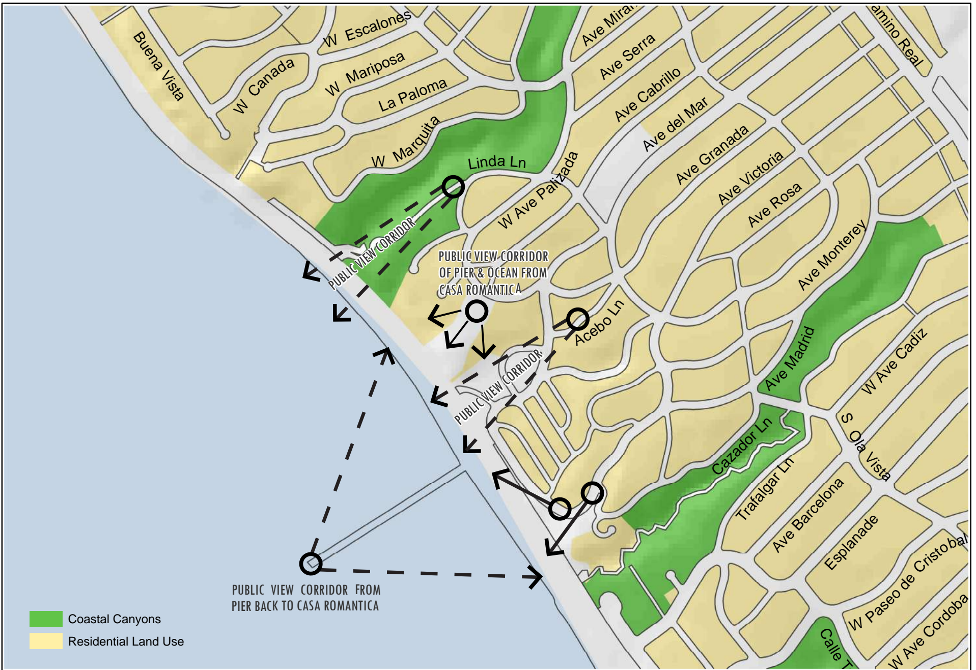
Pier Bowl Area - Public View Corridors

Data Source: City of San Clemente Master Landscape Plan for Scenic Corridors, 1992; City of San Clemente Specific Plans Note: For more detail, please refer to specific plans.