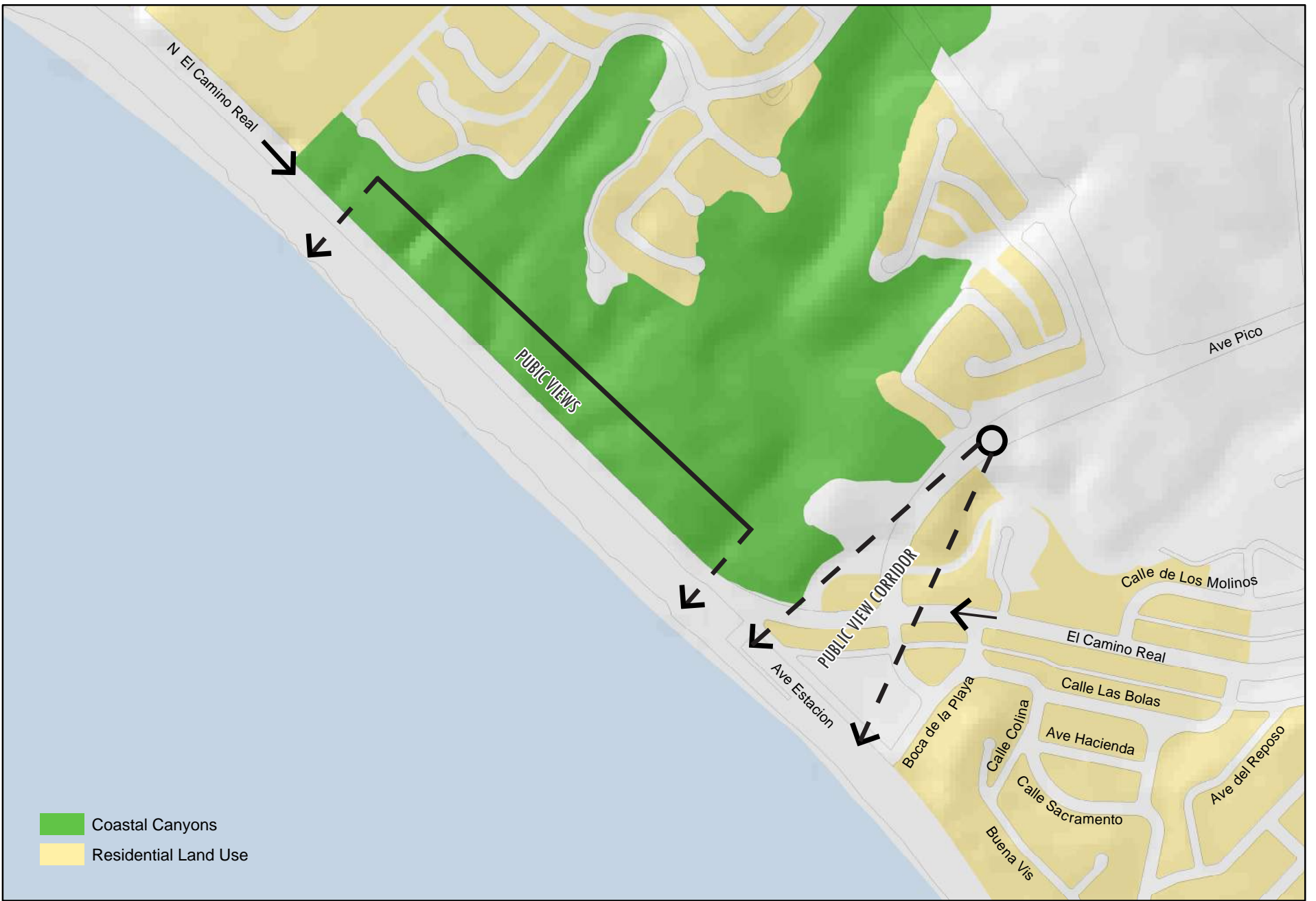
North Beach - Public View Corridors