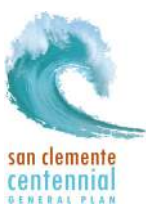
Figure NR-1 AESTHETIC RESOURCES

Data Source: City of San Clemente Master Landscape Plan for Scenic Corridors, 1992; City of San Clemente Specific Plans Note: For more detail, please refer to specific plans.