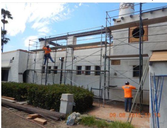
Exterior and historic restoration underway.