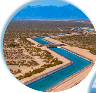
Colorado River Aqueduct