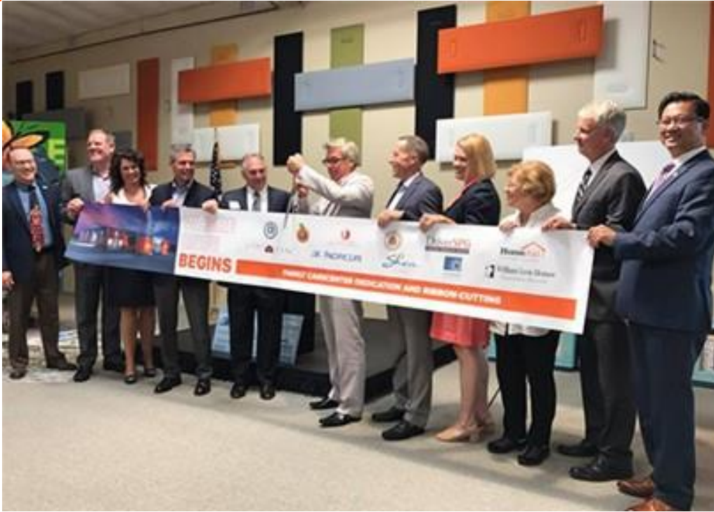
Ribbon cutting ceremony at HomeAid Family CareCenter, first resource established utilizing Senate Bill 2, in the City of Orange.