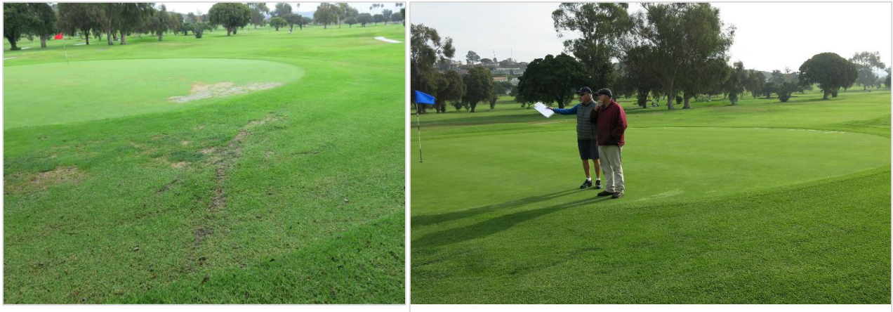
(L) Photo of No. 5 green last year showing turf damage and tree root encroachment. (R) The same area in 2016 showing remarkable recovery as a result of tree removal and the elimination of encroaching tree roots.

Swinecress control – Small infestations of the broadleaf swinecress ( Coronopus didymus ) were evident on several greens. Good control can be achieved by making spot applications of Trimec ® Broadleaf Herbicide Bentgrass Formula at recommended label rates. Superintendents in northern California have also had good results making spot applications of Lontrel ® herbicide. Given the fact that swinecress can germinate and establish over an 8-month period, it was recommended to apply bensulide in March and June to prevent germination and establishment.