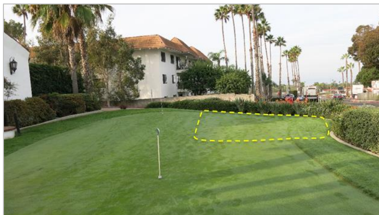
Raising the west end of the practice green by adding sand is not recommended since this will reduce water holding capacity and cause difficulties sustaining healthy turf growth.

The proposed project was reviewed during the visit to raise the west end of the practice putting green to create more usable space for putting and practice. The proposal included stripping the existing turf, adding more sand to level the area and replacing the turf. Although this sounds like a simple and straightforward project, increasing the