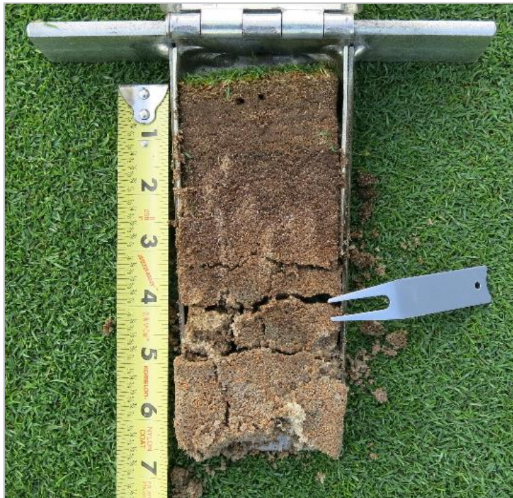
Soil profile samples taken from the greens showed a reduction in organic matter levels near the surface and a deep, vigorous root system, which is an indication that the greens are in healthy condition.

Turf health and playing quality – In general, the greens displayed healthy turf growth and good surface quality on the day of the visit. Examination of soil profile samples indicated healthy root growth to a depth of 4 inches and a slight reduction in organic matter layer levels in the surface of the greens compared to last year. It was good to hear that the Dry-Ject™ aeration method was used earlier in the year with good results. This is an effective and efficient contractor service that has been very popular at other courses throughout Southern California. It was agreed that the Dry-Ject™ aeration process should be used in March and May of next year as part of your annual core aeration and sand topdressing program. The maintenance staff has also done an excellent job of controlling bermudagrass and kikuyugrass infestations while increasing the overall population of creeping bentgrass in the greens. This has resulted in a stronger, more resilient turf with better overall playing quality. Current agronomic programs for management of the greens are on the right track and should continue as planned over the coming year.