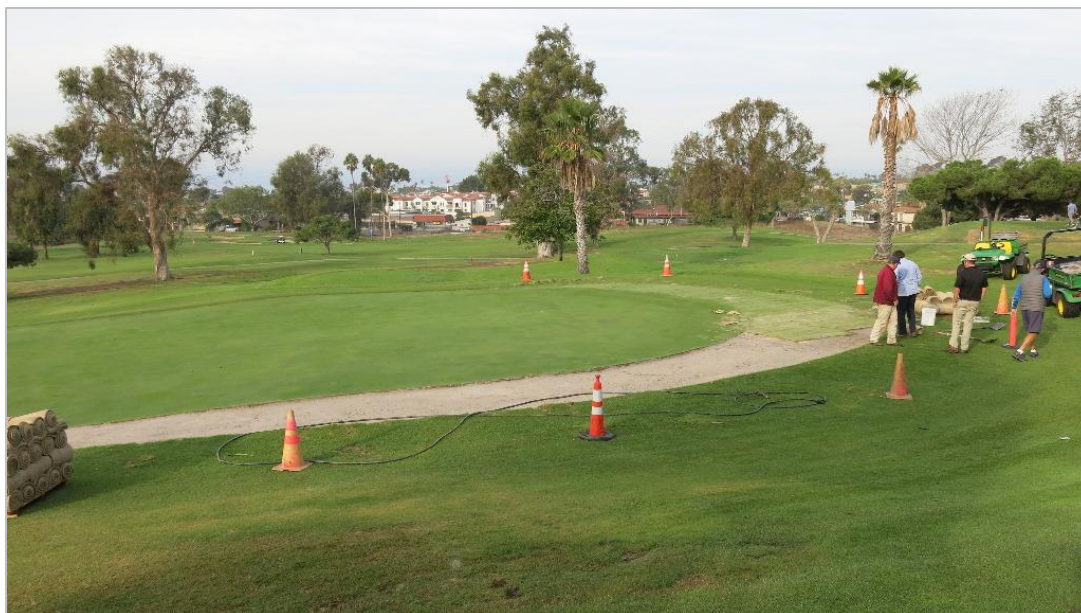
A project to restore the original size and shape of No. 17 green was in progress on the day of the visit, which has successfully restored previously lost hole locations.

Putting green expansion – A project was underway on No. 17 green to restore the original size and shape of the green and reclaim lost hole locations. The protocol involved probing the perimeter of the green to find the extent of the original root zone mix followed by excavation of the bermudagrass/kikuyugrass sod, the addition of a compatible root zone material to restore a uniform 12-inch root zone depth and sodding with creeping bentgrass. Details of the project were found to be consistent with sound agronomic practices, and it was recommended to continue with this project using the same protocol with priority given to the restoration of expansion of No. 3 green.