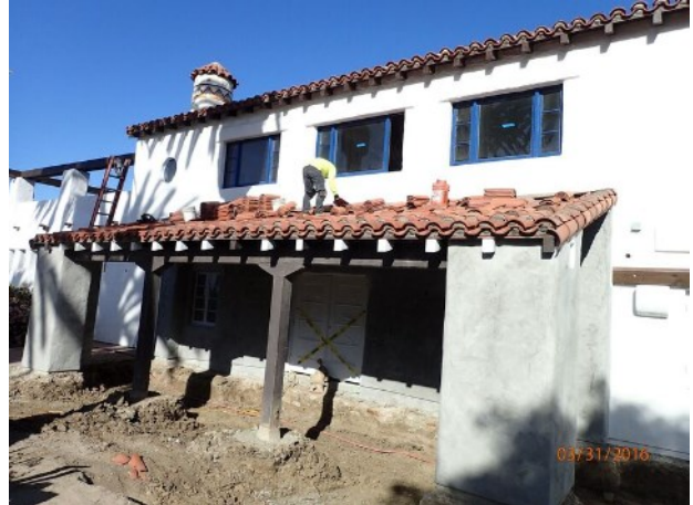
Stucco siding installed and painted.