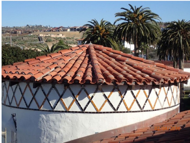
Roof tiles installed.

Pictures were taken from April 4, 2016—April 22, 2016