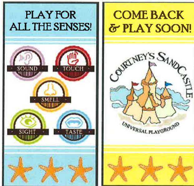
Example of Single Banner Bracket: