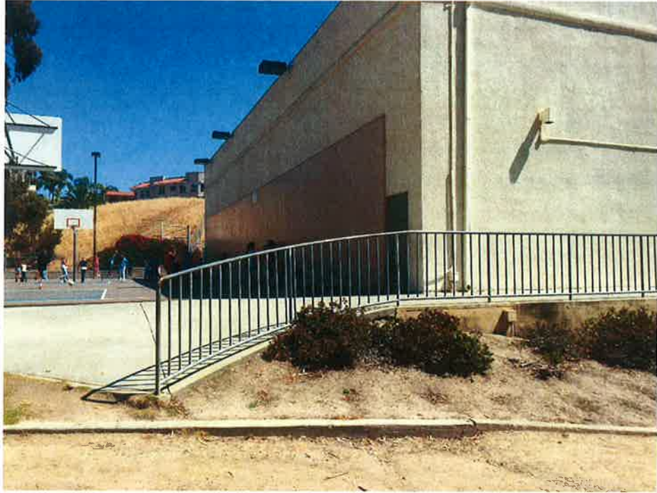
Proposed public access gate