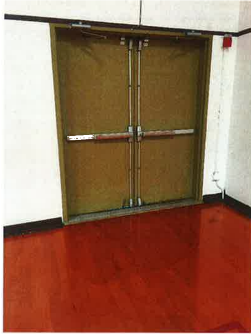
Doors in gym affected by proposed gate