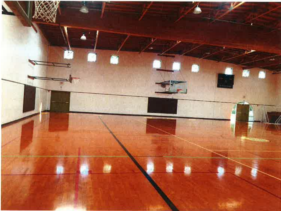
Existing gym doors not affected