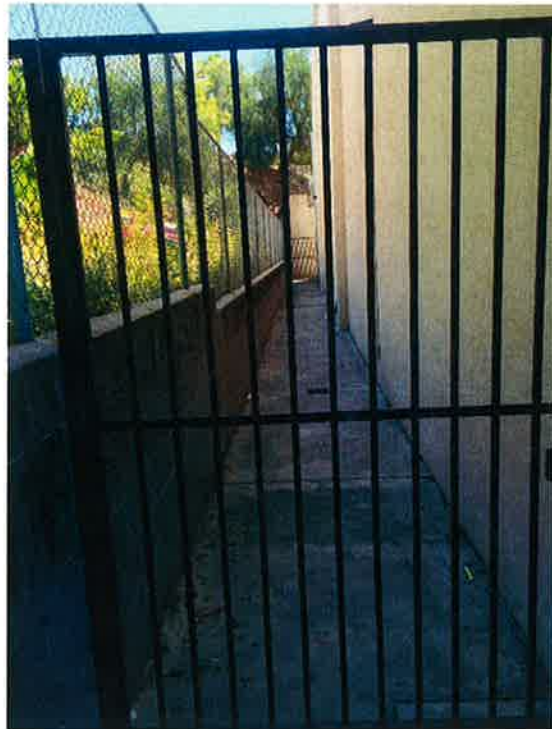
Existing gated area behind Boys and Girls Club