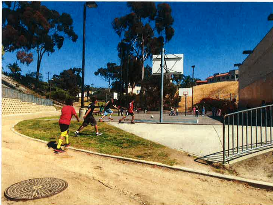
Proposed fencing perimeter