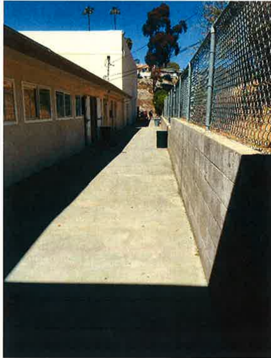
Proposed gated area for tables and chairs