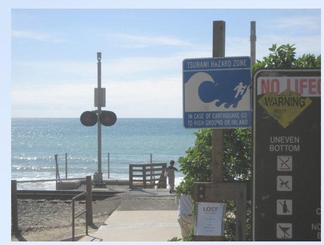
Tsunami Hazard Zone Sign, San Clemente State Beach San Clemente, CA