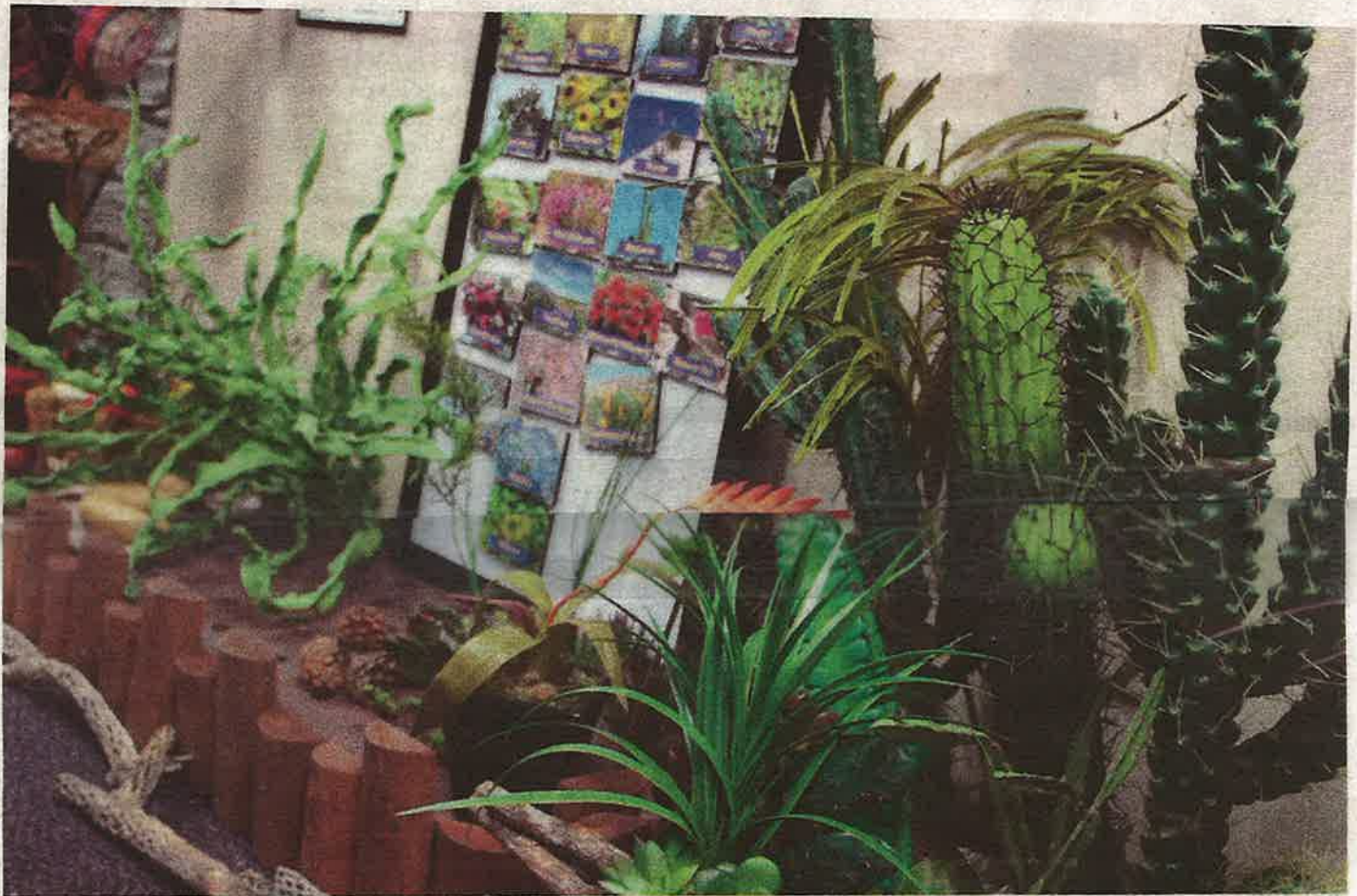
Desert plants illustrate the importance of water in different parts of the ecosystem at the Earth Lodge.