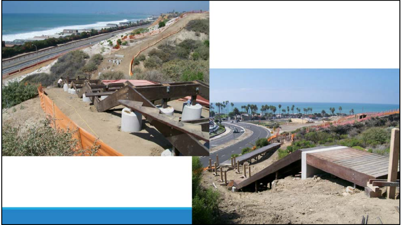
Currently under construction and expected completion is end of December.