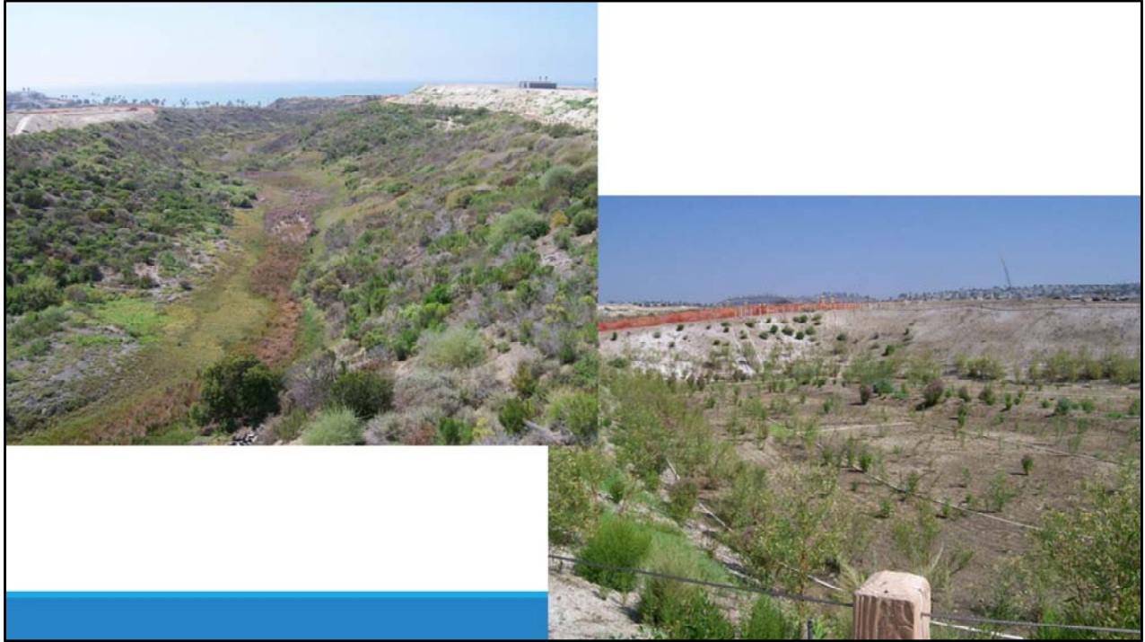
Over 100 acres of habitat restoration, about 90% complete.