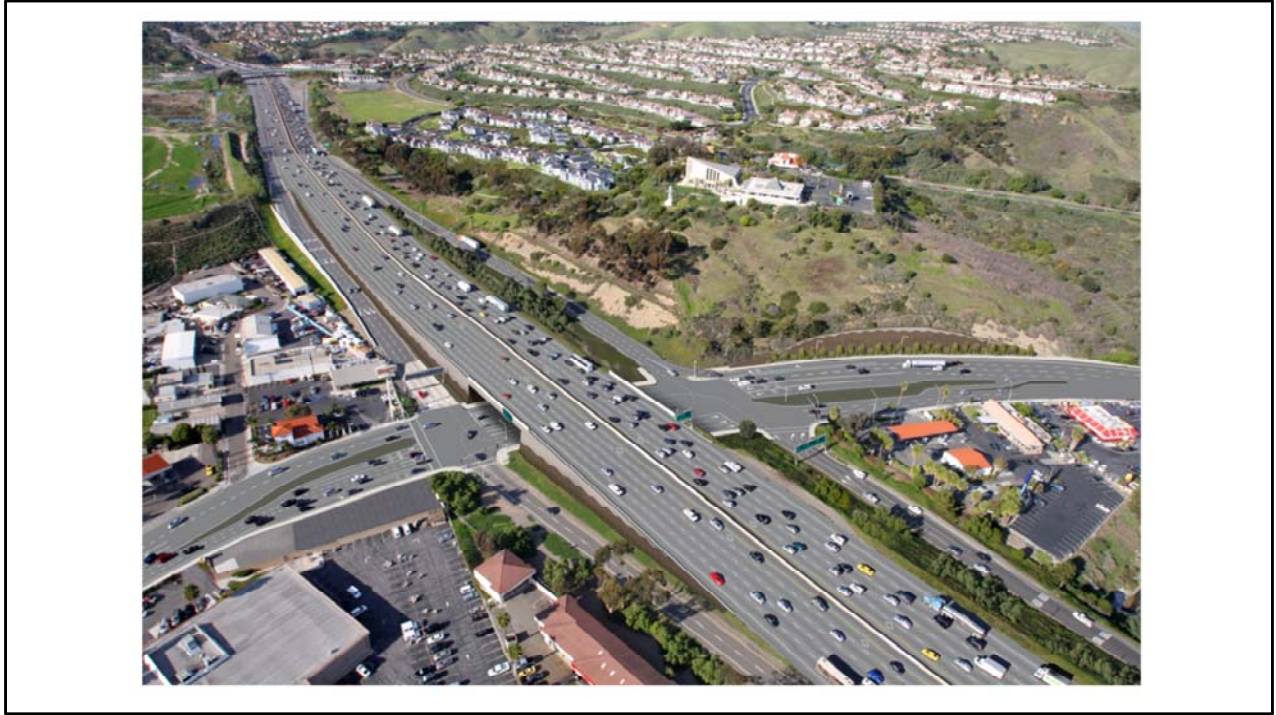
Pico interchange before and after construction