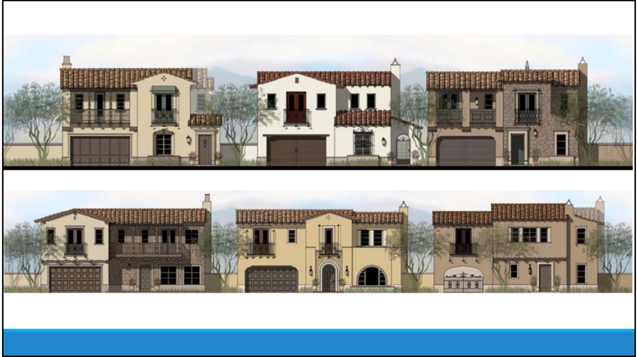
Examples of residential architecture. Pending approval of building plans, Taylor Morrison anticipates starting model home construction in February 2015 with opening in July 2015.