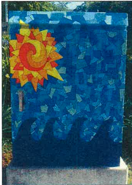
Calle Negocio & Amanecer