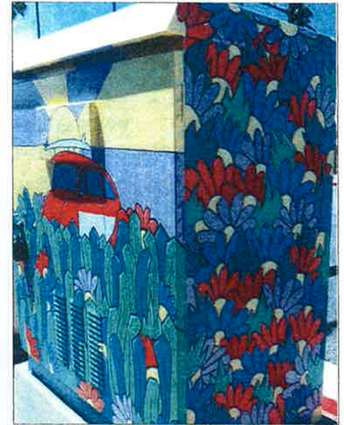
ECR & Mariposa at CVS