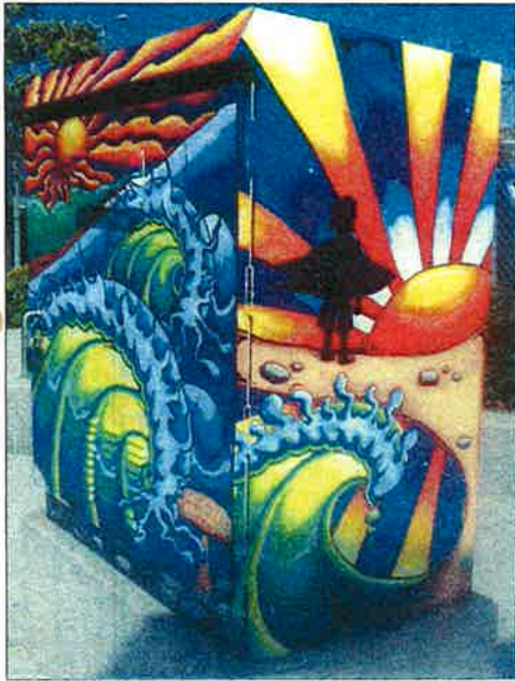
San Clemente High School