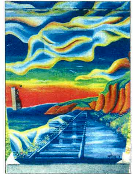
Del Cerro & Vista Montana