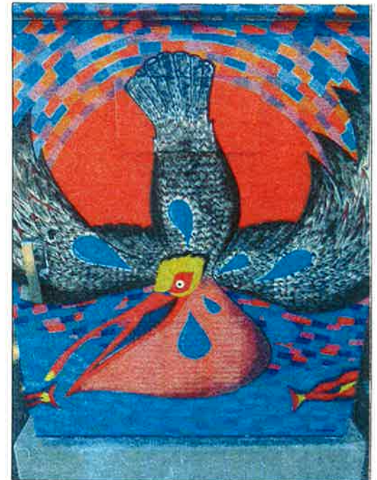
Ave Pico & Del Cerro