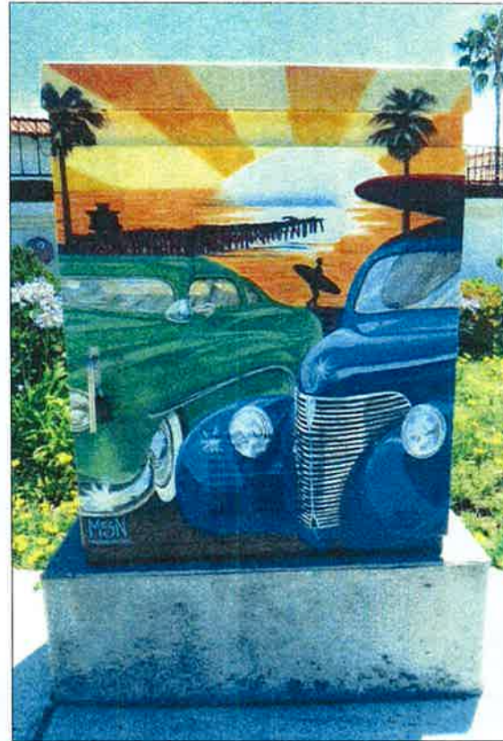
Palizada & Estrella (I-5 on/off ramp) By Meghann Nelsen