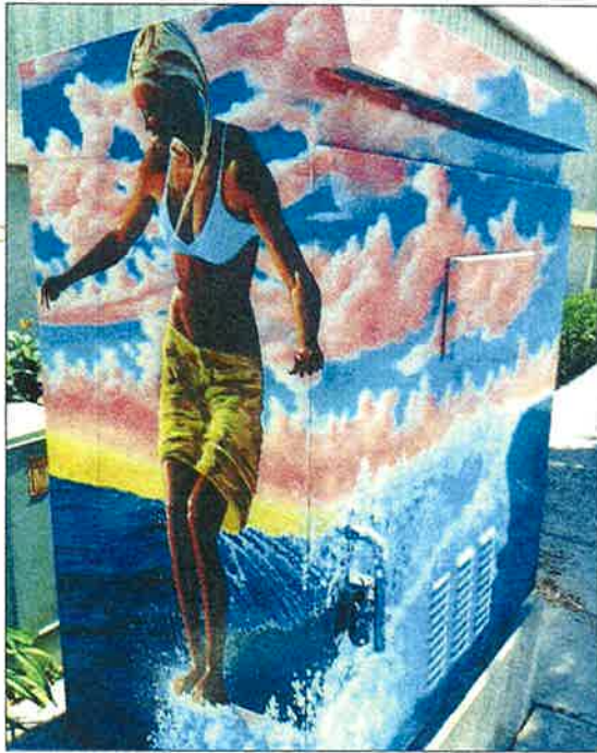
Avenida Pico & Los Molinos